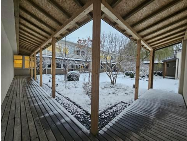
Cosy shelter from bad weather.