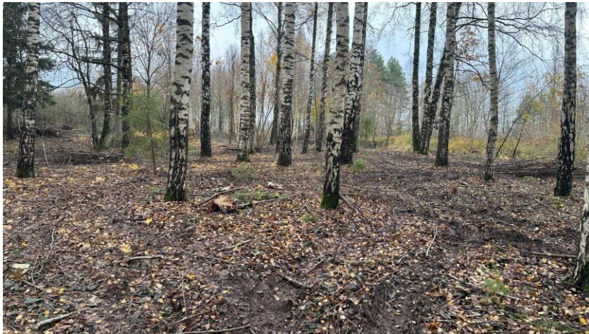
Cleaning territory for recreational path.