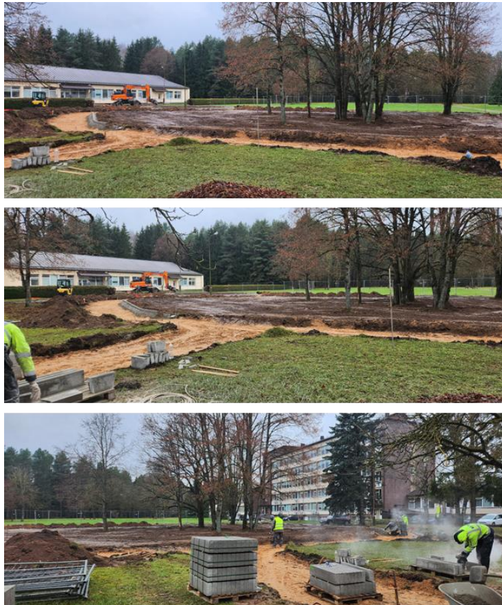
Building works in progress near Biržai hospital.

A construction contract was signed on September 8, 2025, for Phase I of the renovation of the courtyard area at Biržai Hospital.