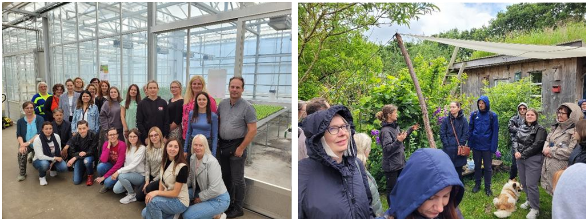
Experience sharing meeting in Aarhus Area, June 2024

We have also participated in International Conference in Latvia September 2025