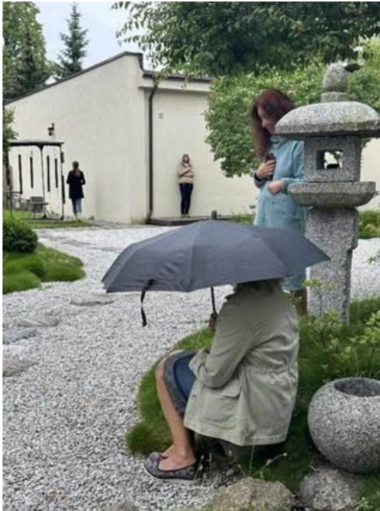
The moment of relaxation.