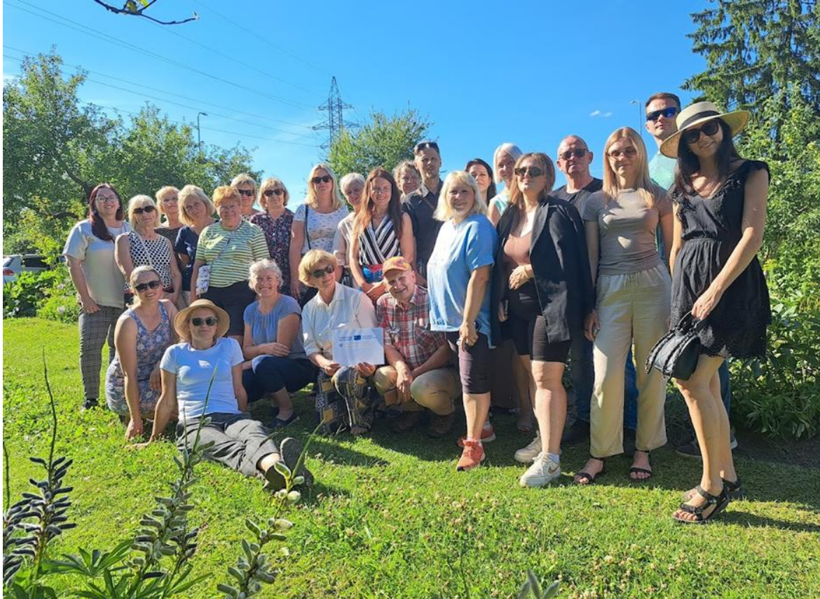
Project partners participating in the experience exchange meeting at the Timuti community garden on 10th July 2024.

In 2024, during the first project year, Estonian University of Life Sciences participated in the experience exchange meetings held in Latvia, Lithuania, Finland and Denmark. In July 2024, Estonian University of Life Sciences held an experience exchange meeting in Tartu. During the meeting we visited the Estonian University's Rõhu Research Centre and met the associated organisation partner Tartu Gardening and Beekeeping Society in the Timuti community garden (picture).