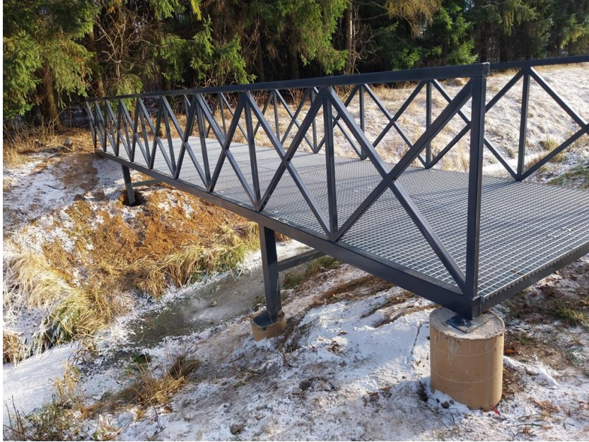
Bridge for future path in Širvėna landscape reserve.