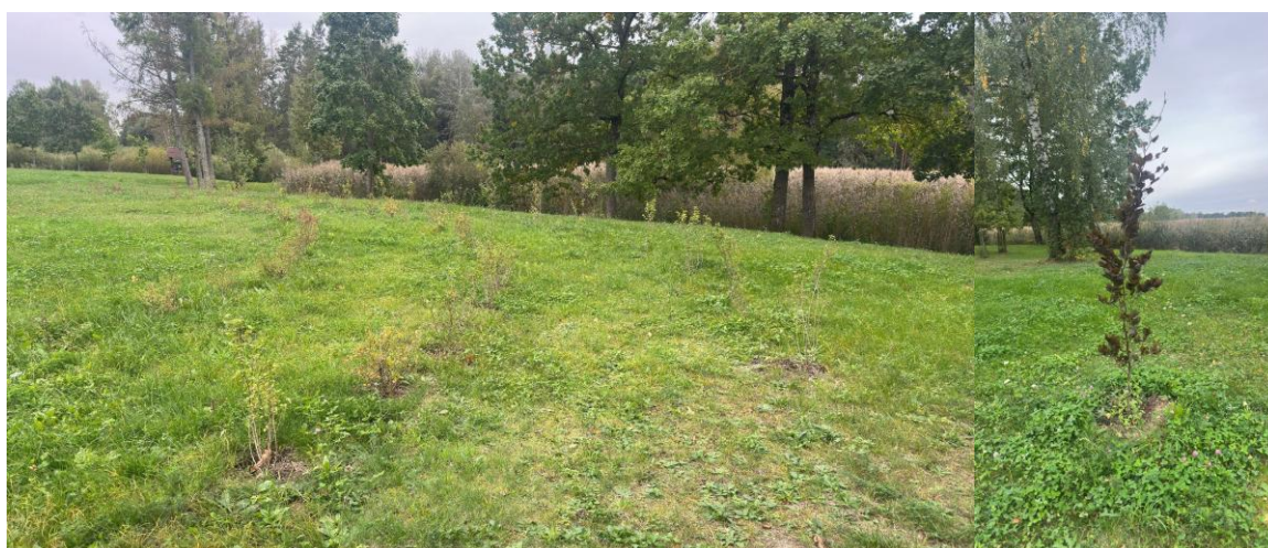
Planting of lilac, beech trees.

Some photos presenting implemented works in Širvena landscape reserve.