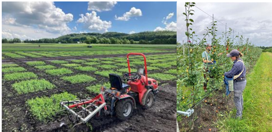
Left: One of the research fields established with a wide range of pea varieties.

During the project, we have further developed our Education and Research Garden and maintained and prepared the research vegetable fields and the orchard for dissemination and education activities.