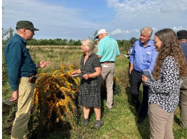
Food Festival 2025

Our garden is not open to the public. However, we have planned and carried out a wide range of garden and horticultural activities in the areas of training (students of various kinds) and dissemination (interactive platform, field walks, oral presentations, demonstrations etc) to local and regional citizens, NGO, business and municipality stakeholders. Examples include the use of the Garden in our undergraduate and graduate programs, and the dissemination of research findings to the horticultural industry and interest groups. We have also used the Garden and the crops grown there for educational activities at the Aarhus.