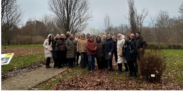
Lithuanian project partner meeting in Klaipėda 25/26 of November 2025

All implemented solutions will bring improved society health, with the possibility to know more about nature and it's protection in Biržai regional park in an interactive way.